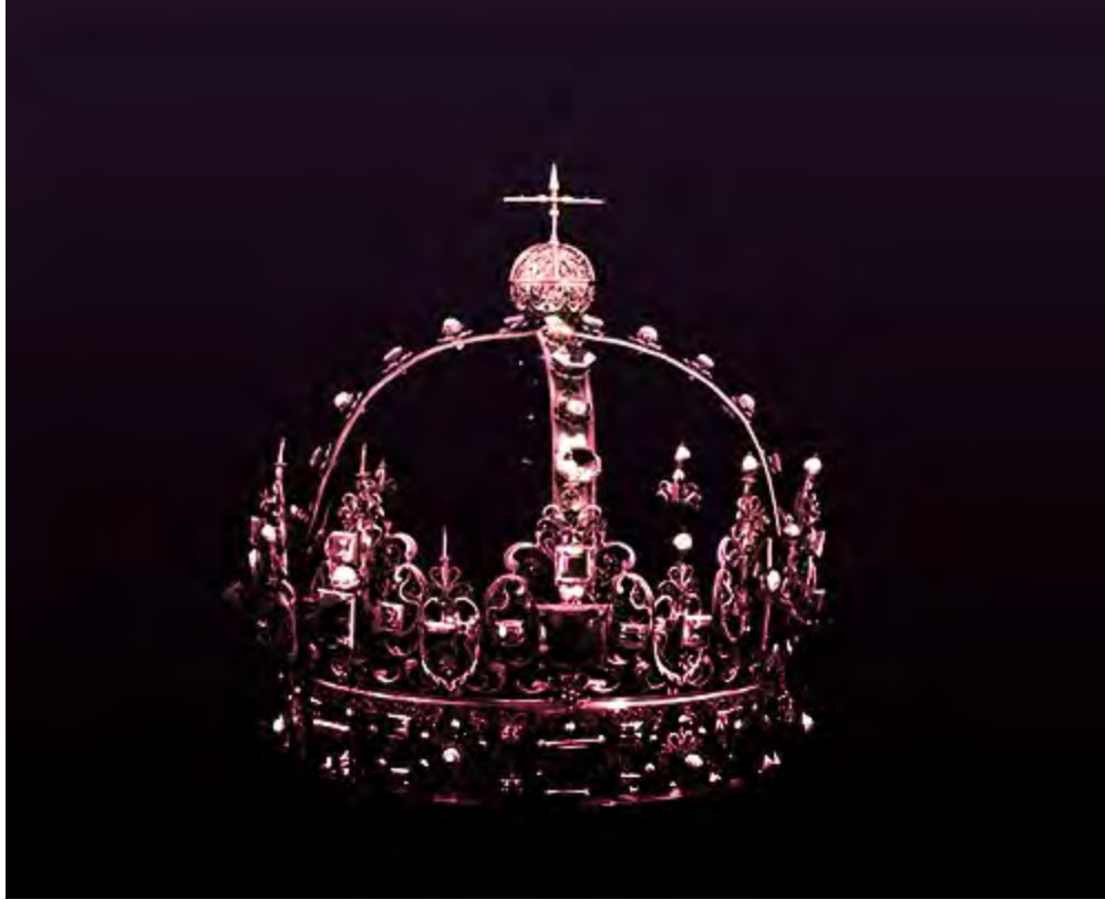
LIVRUSTKAMMAREN (THE ROYAL ARMOURY), CC BY-SA VIA WIKIMEDIA COMMONS.