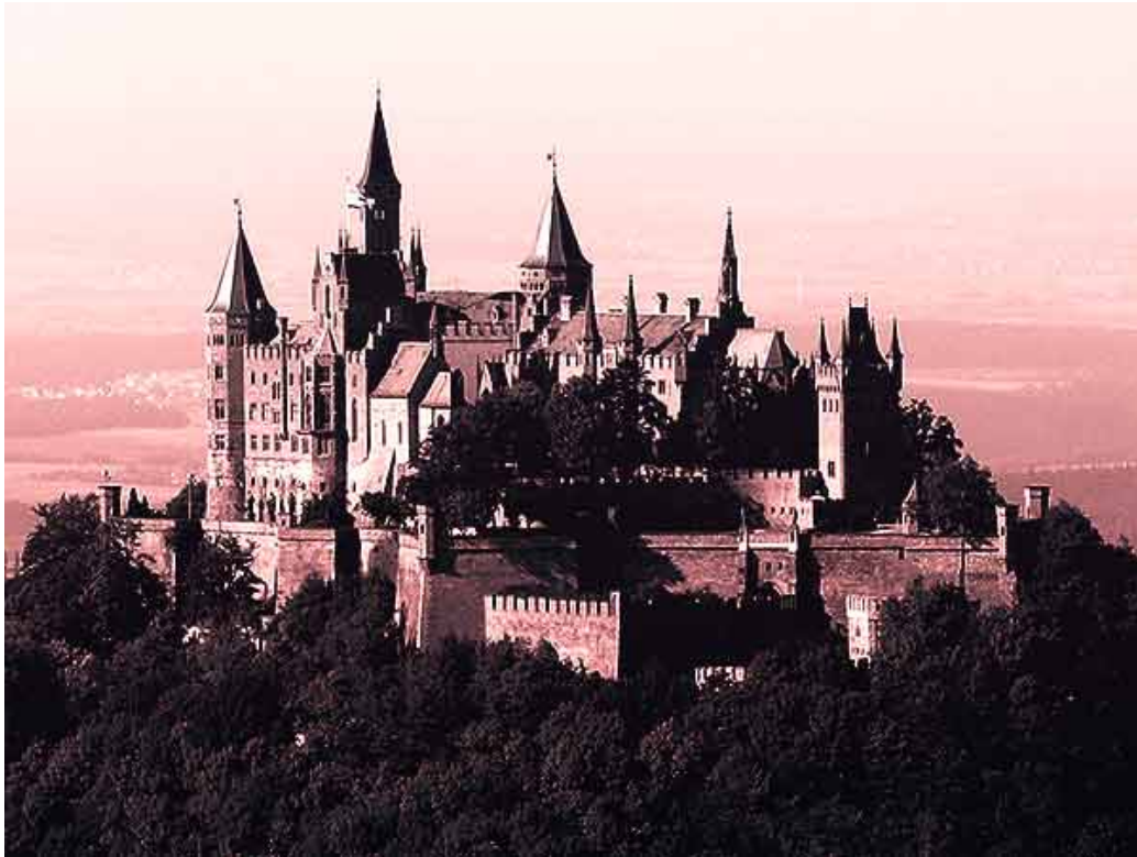
BURG HOHENZOLLERN

The lot listing doesn't say who put the tiara up for auction, just that the tiara has remained in the family "by descent." What does that mean? It means the tiara has been passed down through family of the original owner up to this point.