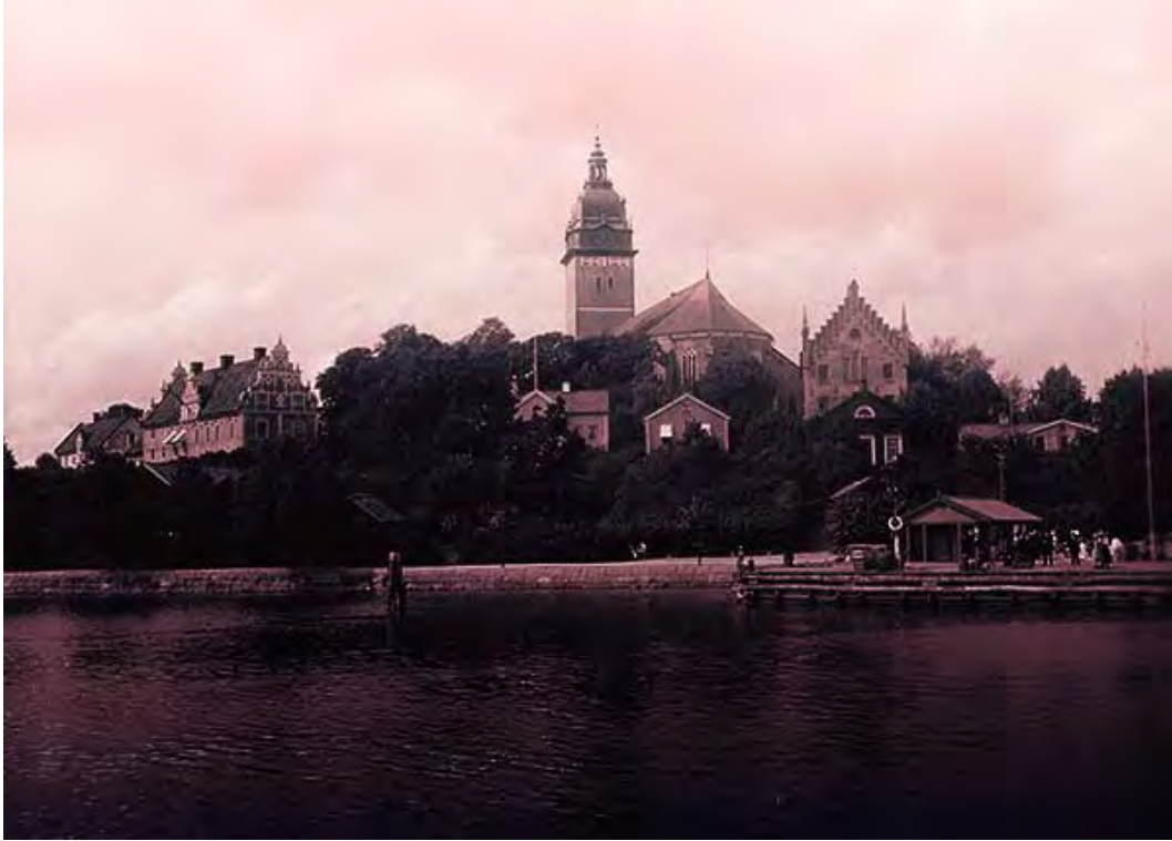
STRÄNGNÄS CATHEDRAL