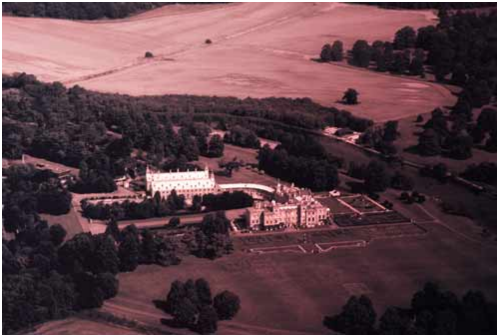
WELBECK ABBEY

On November 20, thieves broke into The Portland Collection, a museum on the Welbeck Abbey estate in Nottinghamshire (shown below), where the tiara and a diamond brooch were on display in an armored glass case.