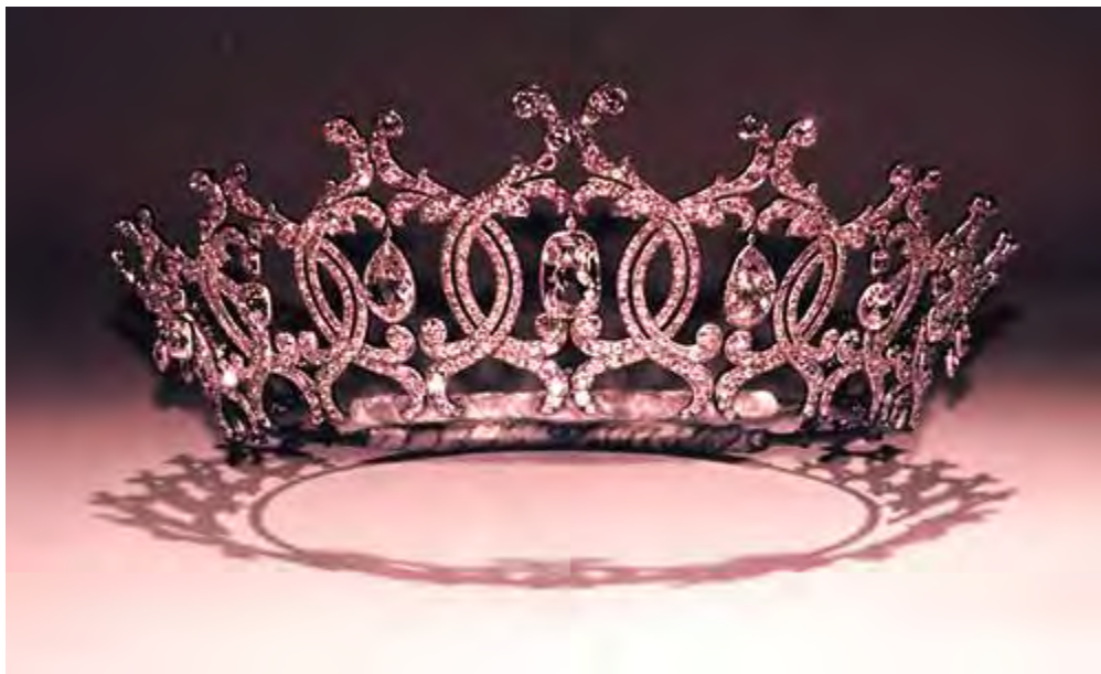
THE PORTLAND TIARA

IN THE SAME POST I linked to above, I also talked about the Portland tiara theft. The Duchess of Portland wore this diamond tiara to Edward VII's coronation in 1902. Her husband had commissioned it from Cartier specifically for the event.