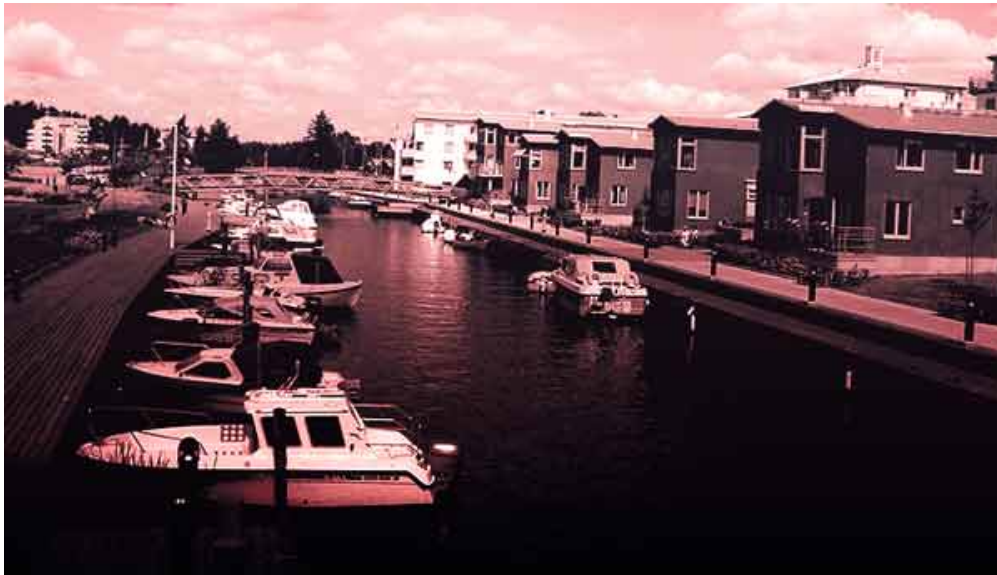
ÅKERS CANAL